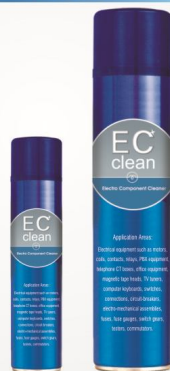
Available in 133ml & 350 ml pack